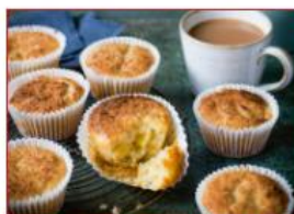
Pineapple & Coconut Muffins ⓘ

Finally select your Pudding choice by clicking on the image below.