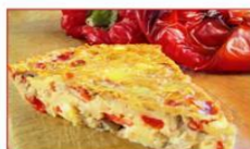
Cheese & Pepper Quiche