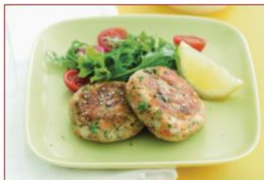
Pea, Sweet Potato & Corn Croquette ⓘ