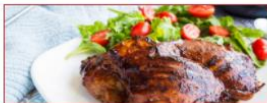
BBQ Chicken ⓘ

Please select your Main Meal choice by clicking on the image below.