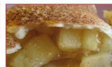
Apple & Cinnamon Layer and Cream

Please make your selections below for: 08/03/2019