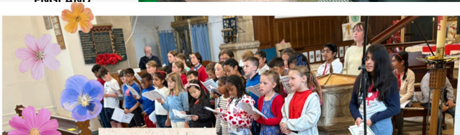
VE Day performance at St James Church Mere Green